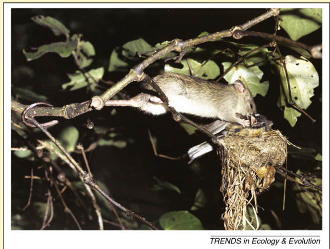
Figure 1. Black rat ( Rattus rattus ) eating a New Zealand fantail ( Rhipidura fuliginosa ) at its nest.

This process provides transparency about the opportunity costs of decisions and the tradeoffs between taking action on different islands. Further real-world complexities can also be addressed within this resource allocation model. These include (i) measuring complementarity between areas when they overlap in species composition; (ii) potential incomplete eradication and the need for additional and/or continuing investment for conservation [40]; (iii) per-unit area differences between islands in the cost of eradication due to habitat, topography and average rat densities; and (iv) interdependencies between costs, values, benefits and probability of success of alternative actions (e.g. fencing and baiting).